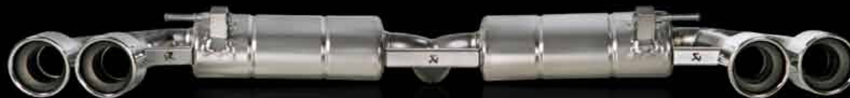
Audi TTS Slip-On system

Hard facts: Titanium, 3 HP plus, 5 Nm plus, 8 kg lighter