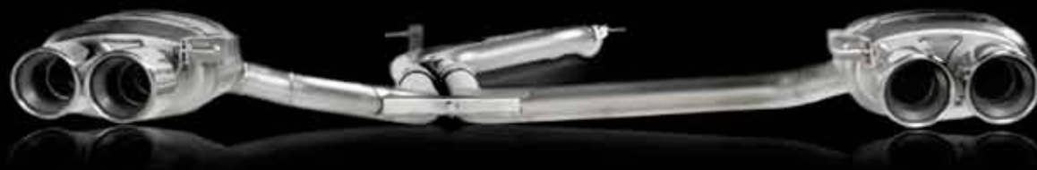
Audi S5 Slip-On system

Hard facts: Stainless steel, 2 HP plus, 14 Nm plus, 4 kg lighter