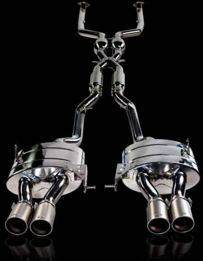
BMW M3 Evolution system

Hard facts: Titanium, 22 HP plus, 35 Nm plus, 24 kg lighter