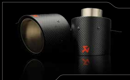
Carbon fiber tail pipe set for Mini Cooper S