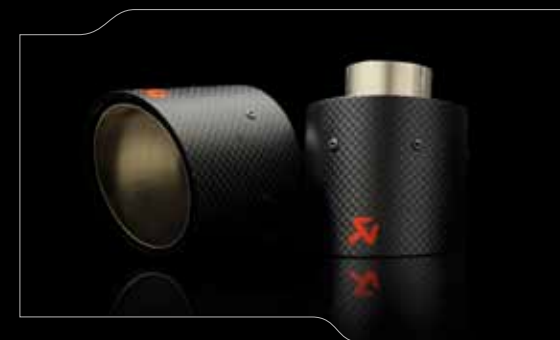
Carbon fiber tail pipe set for Mini JCW