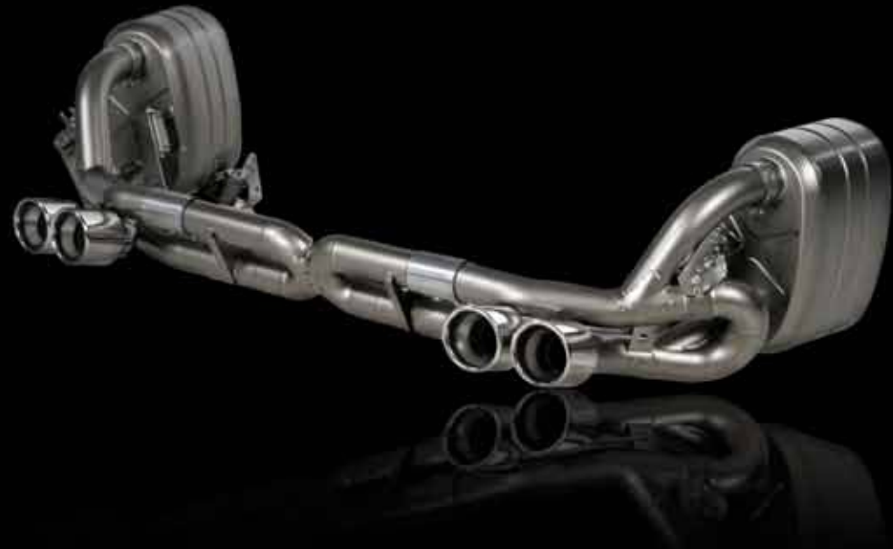
Porsche 911 Carrera/Carrera S Slip-On system

Titanium, 17 HP plus, 30 Nm plus, 10 kg lighter