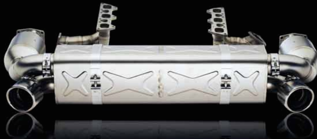
Porsche 911 GT2 Evolution system

Hard facts: Titanium, 41 HP plus, 74 Nm plus, 5 kg lighter