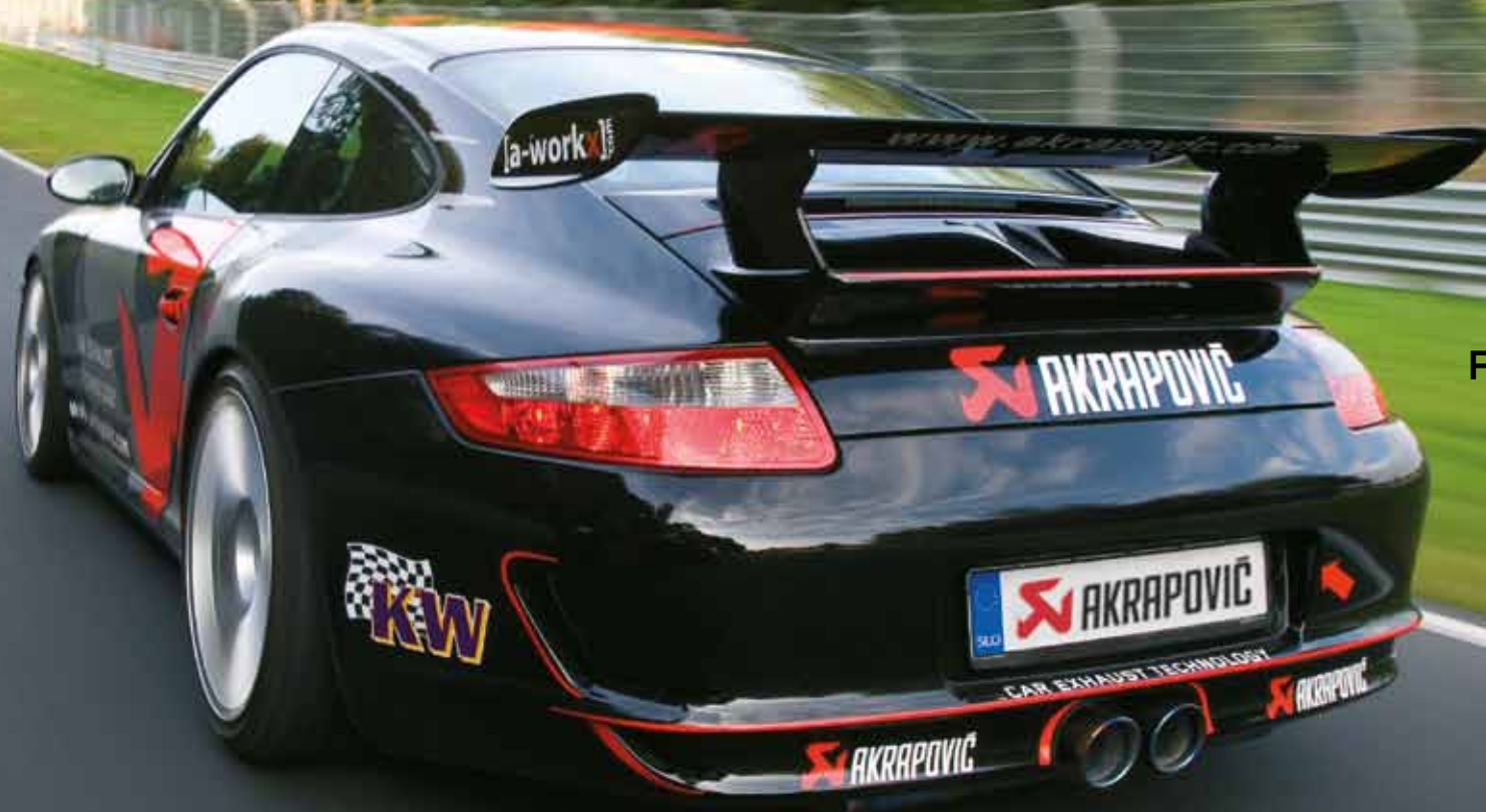
Porsche 911 GT3