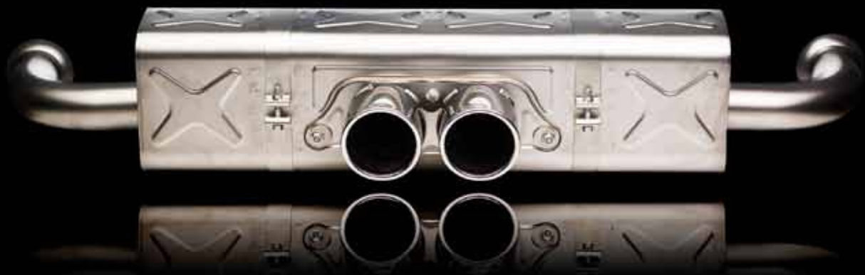
Porsche 911 GT3 Sports Cup system

Hard facts: Titanium, 8 HP plus, 16 Nm plus, 21 kg lighter