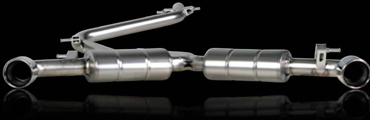
Volkswagen Golf GTI Slip-On system

Hard facts: Stainless steel, 4 HP plus, 6 Nm plus, 7 kg lighter